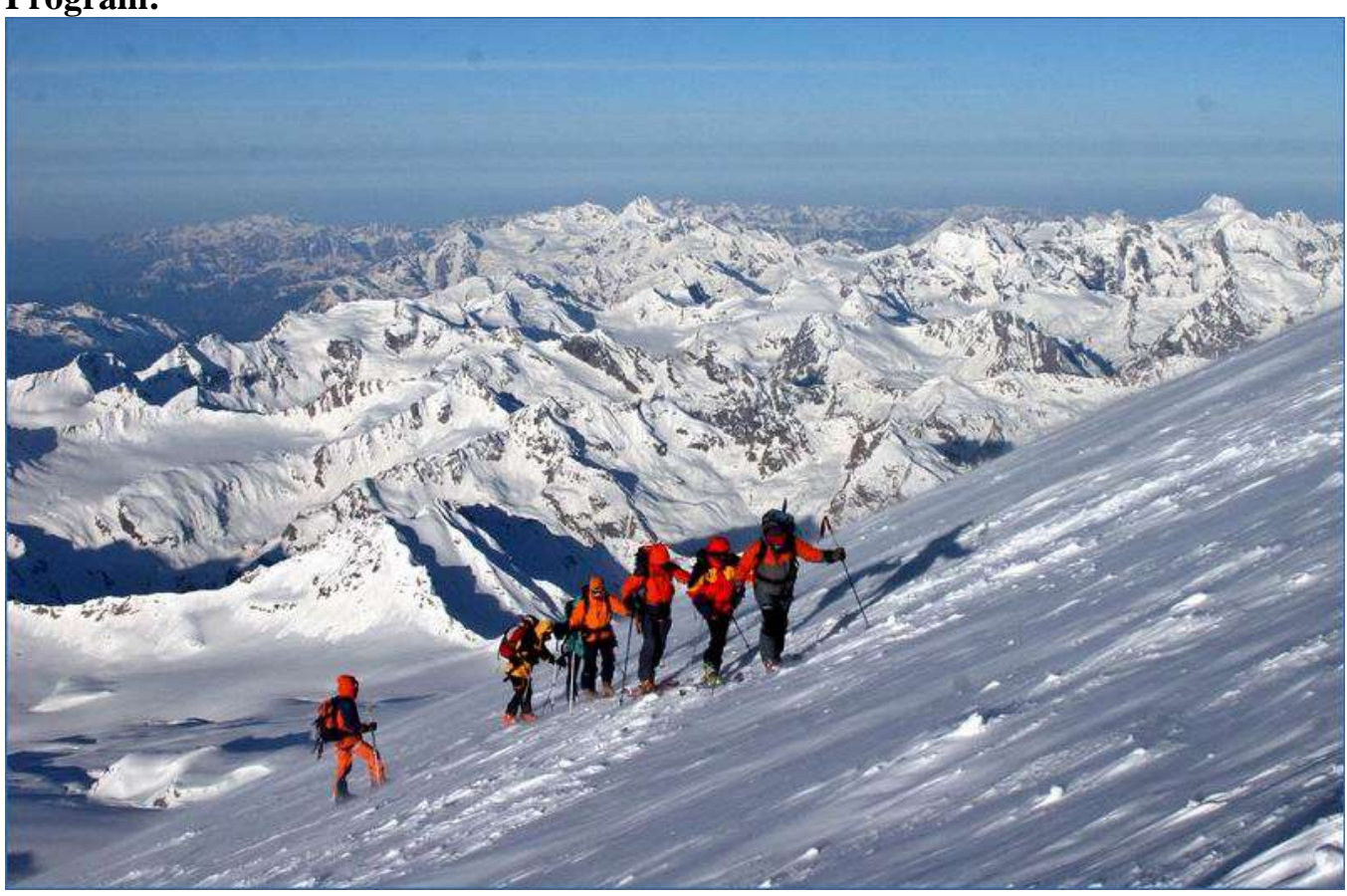
Day 1. Flight to Min Vody, arrival. Transfer to to the hotel (at about 2100m) in Baksan valley near Mt Elbrus.